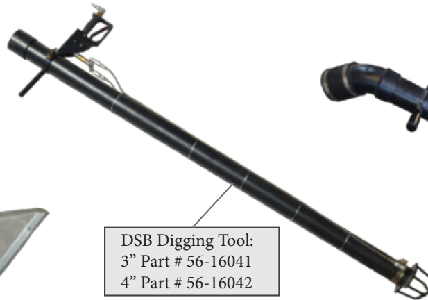
DSB Digging Tool: 3" Part # 56-16041 4" Part # 56-16042