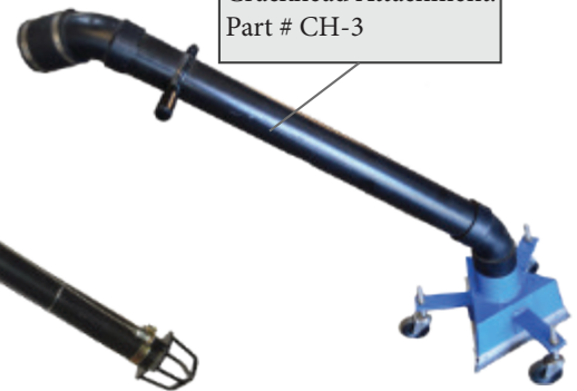
Crackhead Attachment: Part # CH-3