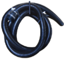
VACUUM HOSES: 3" by 25': Part # 53-11042 3" by 50': Part # 51-11057