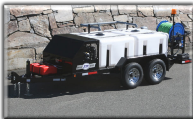
Eagle 600 Tandem-Axle Trailer

The newly re-designed Eagle 300 Trailer Jetter now offers upgrades like Liquid-cooled gas engines (combined 62 HP), remotely mounted mufflers, a protective and aerodynamic front end enclosure, and attractive low profile appearance, offering our customers the look, feel, performance and operation of trailer jetters requiring double the investment.