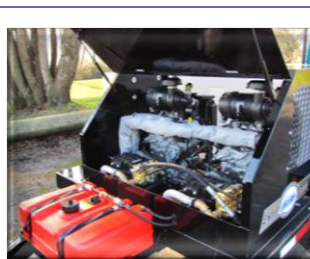
Front End Enclosure Protects Engines and Pumps

A Division of Seattle Pump and Equipment 2222 15 th Ave West Seattle, Washington 98119