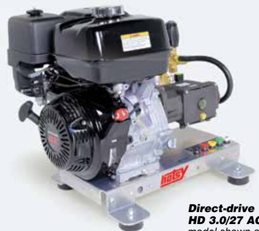
Direct-drive HD 3.0/27 AG model shown as skid