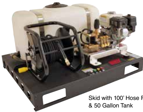
Skid with 100' Hose Reel & 50 Gallon Tank

Select HD pressure washers can be mounted on one of the following skids for mobile cleaning anywhere. Fits within a standard UTV / ATV bed or truck.*