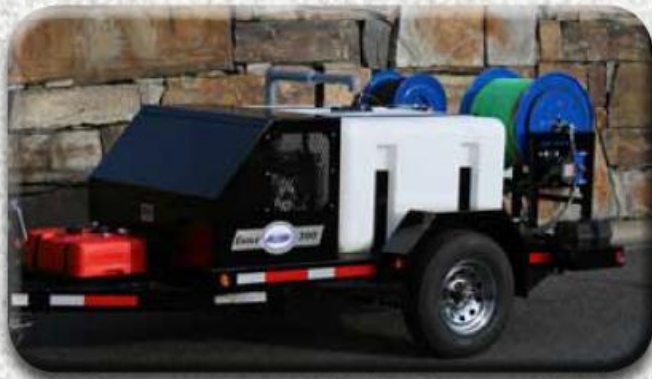
Eagle 300 Trailer Jetter

Quality Reliable Equipment • Expert Advice and Service