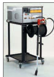
Optional Hose Reel Kit, Cart, Caster Wheel Kit and stainless steel base and cover