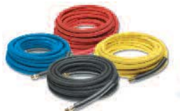
Heavy-duty, high-pressure hoses in lengths up to 150-ft.

Rotary surface cleaner attaches to your pressure washer; reduces overspray and zebra striping