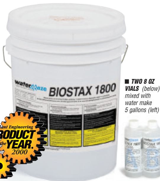
■ TWO 8 OZ VIALS (below) mixed with water make 5 gallons (left)

Important: BioStax 1800 must be kept refrigerated prior to use.